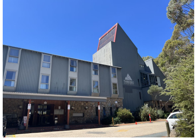
Figure 2 View of the main entrance. Source: Kosciuszko Thredbo Pty Ltd, 22.02.22