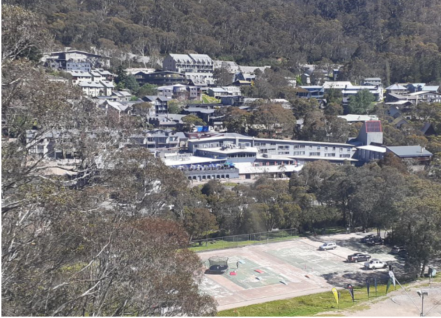
Figure 1 View to Thredbo Alpine Hotel, as viewed from North of the subject site