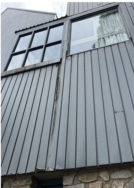
Figure 5 Windows on main entrance side of hotel, above carpark, note cladding deterioration particularly around window sill, and exposed bottom edge. Source: Kosciuszko Thredbo Pty Ltd, 22.02.22