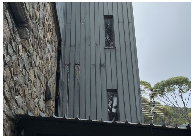
Figure 6 Wall above maintenance workshop, note failing cladding. Source: Kosciuszko Thredbo Pty Ltd, 22.02.22