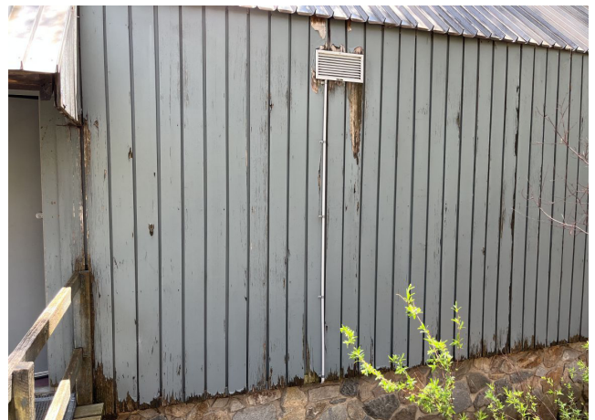
Figure 4 Deteriorated timber cladding, at the rear corner of the hotel near Mowamba Place.