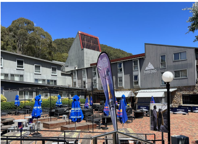
Figure 3 View of Hotel Terrace